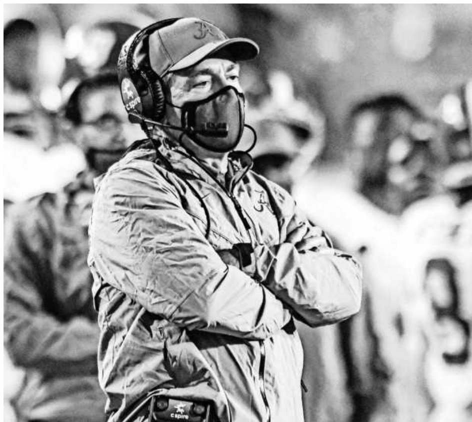
Alabama's Nick Saban was one of several coaches who tested positive for the coronavirus this season.

state of limbo, where July and August of 2021 seem far enough away that you can envision a large degree of normalcy. At the same time, the January reality is that the spread of the virus is at its worst point of the entire pandemic, administrators are bracing for the heavy lift of getting college basketball to the finish line and the vaccine rollout has been so slow in the initial stages that it would be foolish to project where college students would fall in the pecking order.